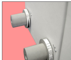
Nip & Pull Roller Adjustment