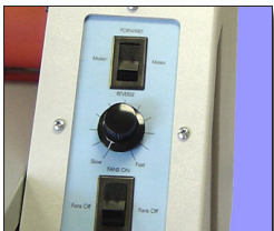
Speed Control & FWD/REV