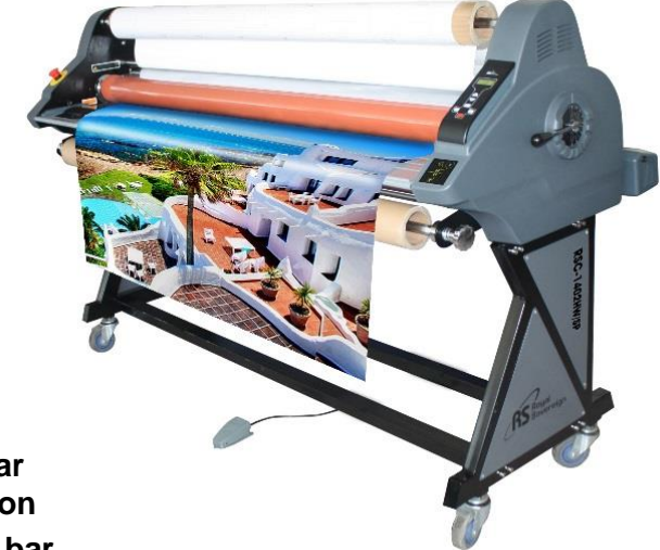
Easy to Use Digital Controls