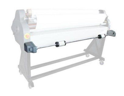
Front Feeder Assembly Optional