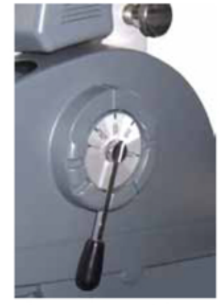
5 position lever adjusts the nip between the rollers while springs maintain even pressure during lamination.