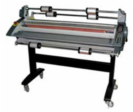
RSH-1151 45" Laminator