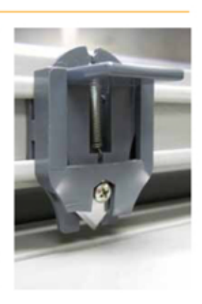
cutter permits simple cutoff as the laminated material exits the rear