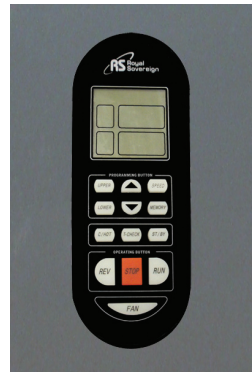
User friendly controls simplify operation