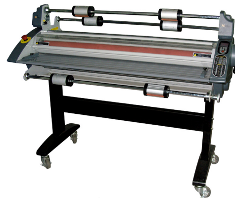
RSH-1651 65” Laminator

5 position lever adjusts the nip between the rollers while springs maintain even pressure during lamination.