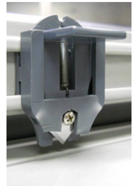
Cross cutter permits simple cutoff as the laminated material exits the rear