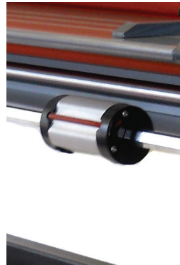
Auto grips to secure film cores to feed and wind up rollers

The RSH-1651 is a high quality, high performance dual hot & cold laminator specifically designed for users to easily and professionally finish wide format graphics. Built for safety and ease of use, this sturdy machine is perfect for laminating and mounting graphics up to 65” wide using pressure-sensitive materials and thermal laminating films. It has a durable, sturdy frame construction and requires little assembly and minimal maintenance. Backed by 25 years of experience, the RSH-1651 is a smart option for today’s full service graphics shops.