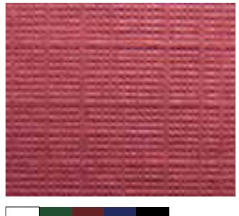
Available in: white, woodland green, maroon, navy and black