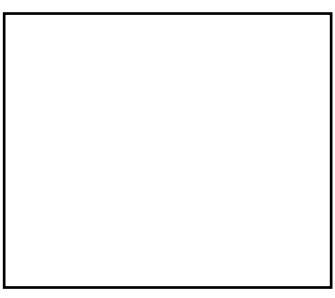
A high gloss white cover with exceptional printing qualities.